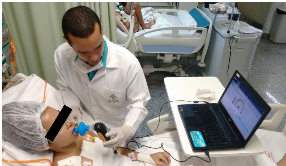
Figure 1 – Participant in semi-Fowler's position undergoing an IMT session on the first postoperative day.

Interventions were performed by junior and senior physiotherapists. However, baseline and outcome assessments were conducted by a blinded senior physiotherapist.