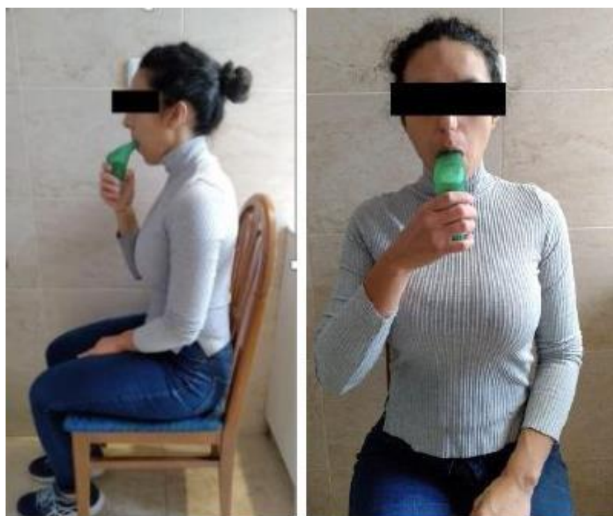
Figure 1. Domiciliary inspiratory muscle training with the POWERbreathe® device.